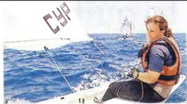
The young Cypriot sailors are in for an almighty challenge